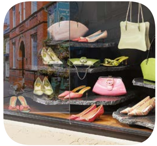
Comparison between Pilkington Optifloat™ Clear (left) and Pilkington OptiView™ (right)