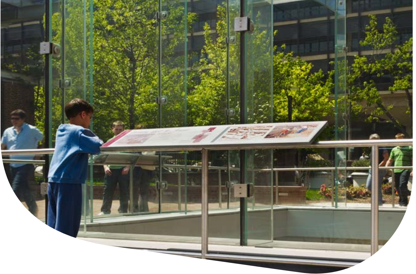
President's House, Philadelphia, Pennsylvania, USA