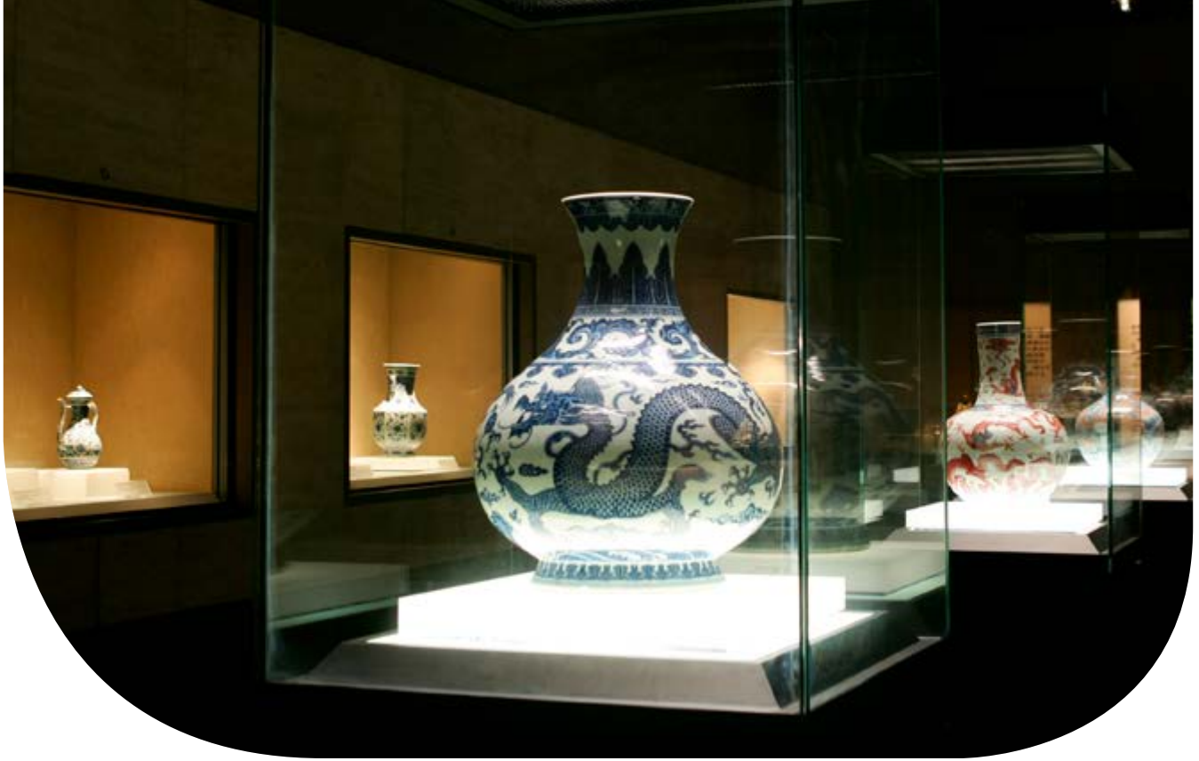
Beijing Museum, China