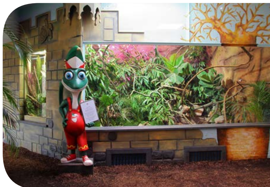
Zoo, Köln, Germany