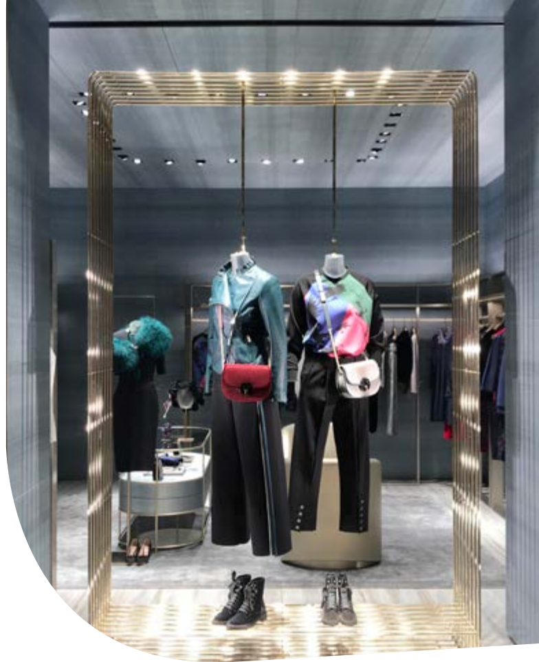
High fashion boutique in Florence, Italy

Adding to its unique properties, it is available in larger sizes and achieves a more neutral color than most of the other anti-reflective glasses, providing architects with greater freedom to innovate than before.