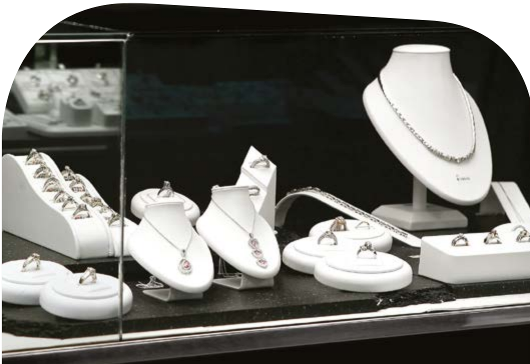
J. Foster Jewelers, Ohio, USA

Pilkington OptiView™ Protect can be used in place of metal bars in applications such as banks, prisons and convenient stores requiring high security.